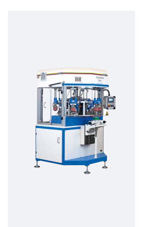
CONCENTRA 90-6 with jig

Ink residue pick-up system and integrated VIPA S7 PLC control are a standard option. Program enhancement possible at any time. Up to 10 program variants per printing station can be stored. Memory cards for additional jobs can be integrated in the external operator panel.