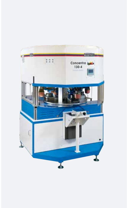
CONCENTRA 130-4 with x-y cross support (option)