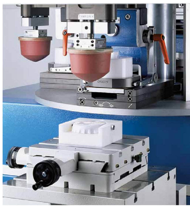
CONCENTRA 90-4 with one jig (aluminum x/y cross slide)