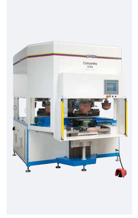
CONCENTRA 210-6 with light curtain (option)