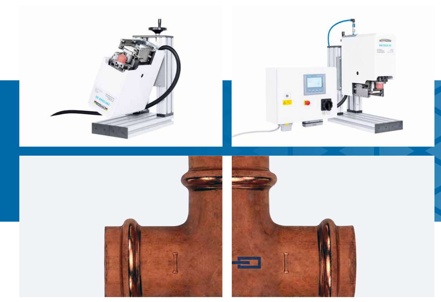
With pad printing it becomes recognizable.

Option overhead control Possibility of overhead printing