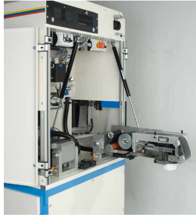
HYBRID-90-2 Slewable printing unit