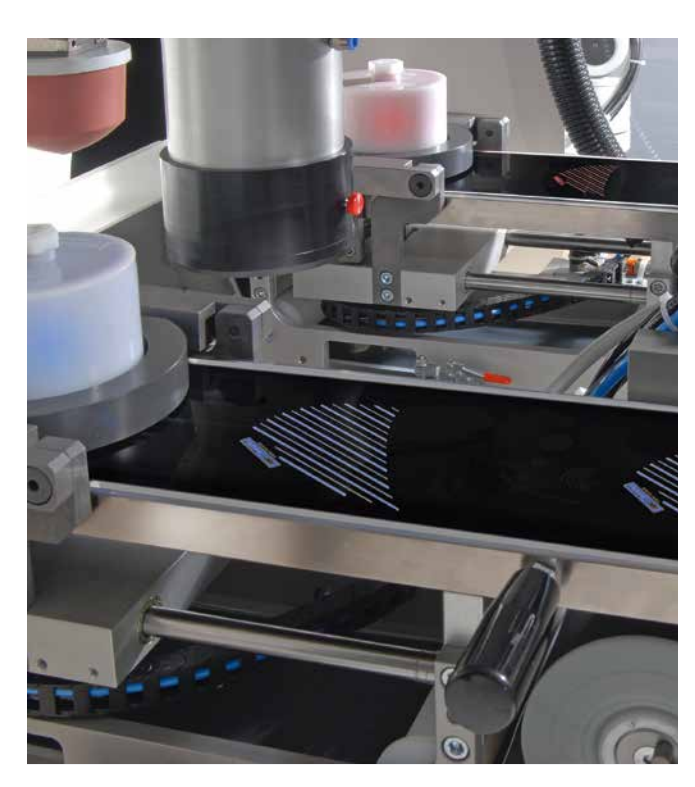
HYBRID-90-2 Integrated laser unit for production of printing clichés