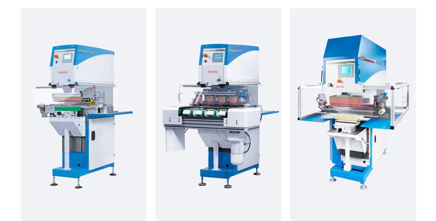
TSM 60/90 universal transverse doctor kit (Similar to illus.)

Versions with servomechanical drive are characterized by a very high number of cycles and a very high force of pressure. Energy-efficient cinematics in doctor or pad movement and a resource-saving machine frame construction round off the successful machine concept.