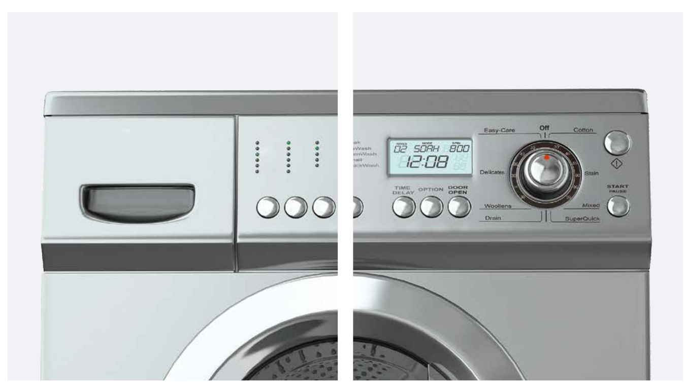
With pad printing it becomes operable