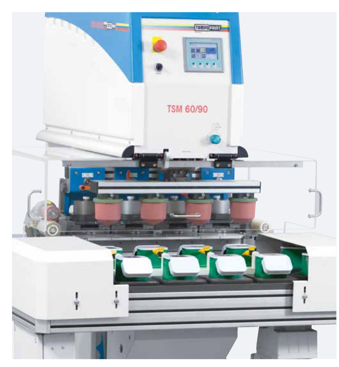
TSM 60/90 universal multiple color kit Solo 4-color printing

TSM 60/90 universal multiple color kit Solo with ink residue pick-up system (option)