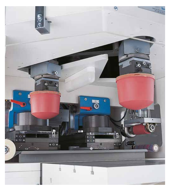
V-DUO integrated in the semi automation MODULE ONE S