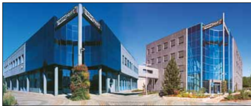
TAMPOPRINT Special machinery construction since 1978