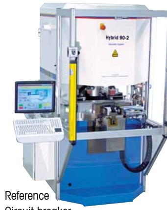
Reference Circuit breaker