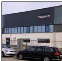
TAMPOPRINT® IBERIA S.A.U., Spain Subsidiary since 2000 www.tampoprint.es