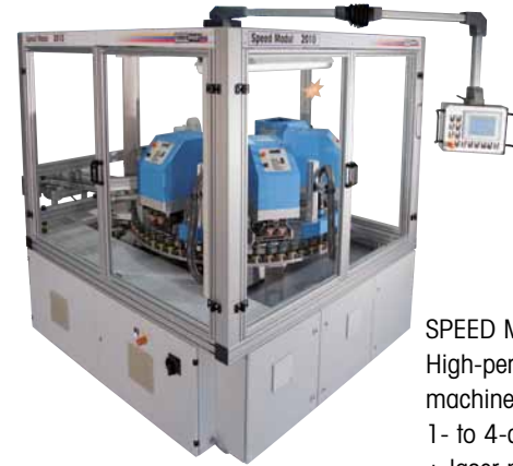
SPEED MODUL – High-performance automatic machine for small part 1- to 4-colour + laser marking

TAMPOPRINT AG is the solid and reliable supplier for the international electronic industry and makes their products successful. We make markings, scales and decorations possible where other processes reach their limits.