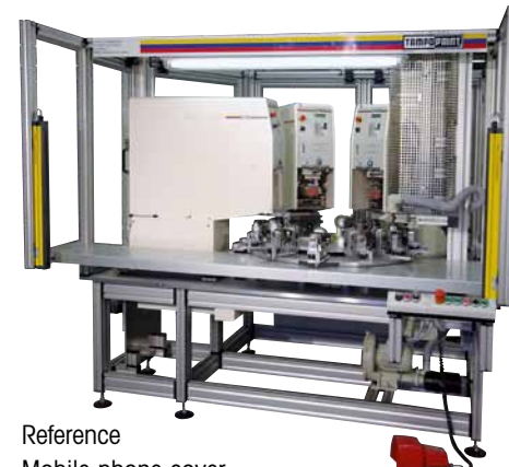
Reference Mobile phone cover