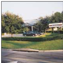
TAMPOPRINT® International Corporation, USA Subsidiary since 1994 www.tampoprint.com