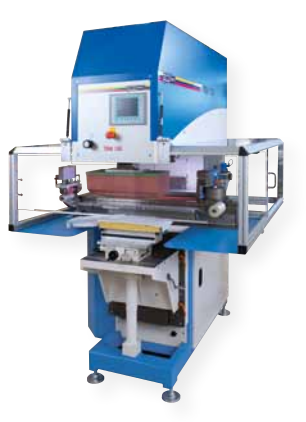
TSM 130 universal transverse doctor kit Washing machine panel