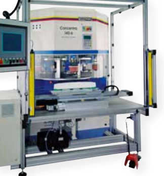
Reference CONCENTRA 140-6 Washing machine panel