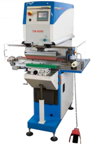
TSM 60/90 universal transverse doctor kit