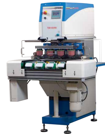
TSM 60/90 universal multiple colour kit Solo