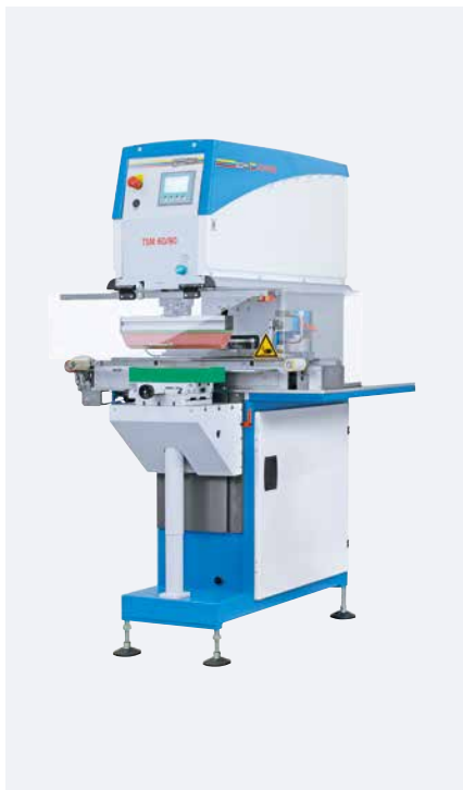
TSM 60/90 universal transverse doctor kit (Similar to illus.)

Versions with servomechanical drive are characterized by a very high number of cycles and a very high force of pressure. Energy-efficient cinematics in doctor or pad movement and a resource-saving machine frame construction round off the successful machine concept.