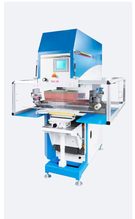
TSM 130 universal transverse doctor kit (Similar to illus.)