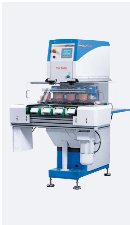
TSM 60/90 universal multiple color kit Solo