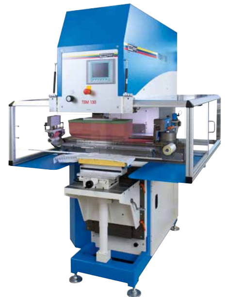
TSM 130 universal transverse doctor kit