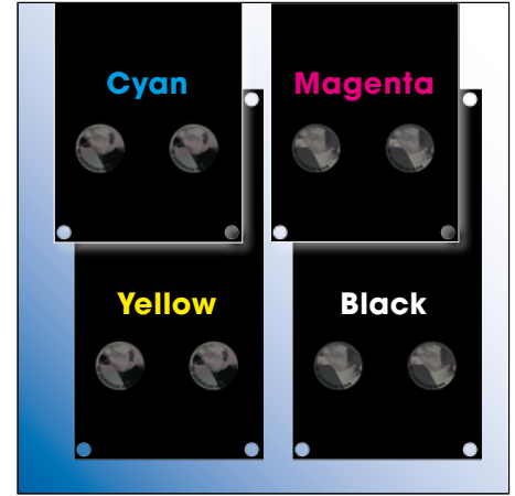
Tampon printing cliché for the 4-colour tampon printing