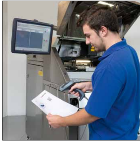
Safe selection of artwork using "Intaglio" software package